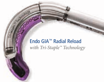
Endo GIA™ Radial Reload with Tri-Staple™ Technology